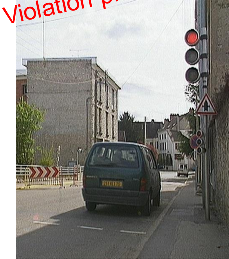
Violation producing conditions