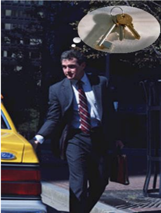
Error – unintentional?