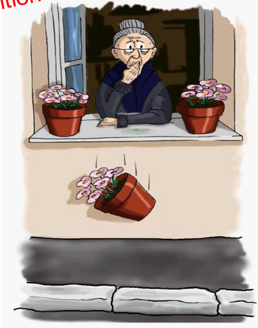
or Violation – intentional?